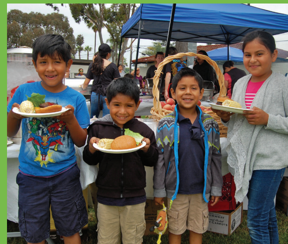
Free summer meals provide nutritious lunch when school is not in session. (Balderrama Park, Oceanside)

Hunger Free San Diego is guided by a local Advisory Board comprised of more than 30 CEOs, decision-makers and experts representing food banks, pantries, social service, government, and healthcare agencies, school districts, early education providers, researchers, funders, and other aligned collaboratives.